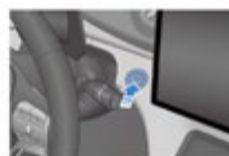
Turn off the ignition