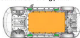
Stabilisation-lifting points High-voltage battery