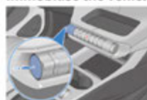
Shift into "P"